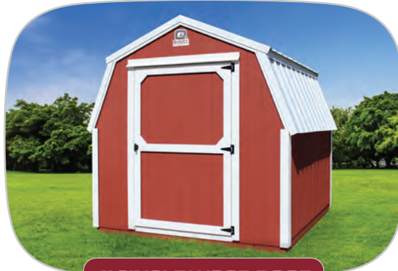
4' SINGLE WOOD DOOR