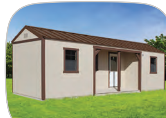
OPEN PORCH OFFICE