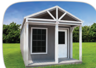
OPEN PORCH OFFICE