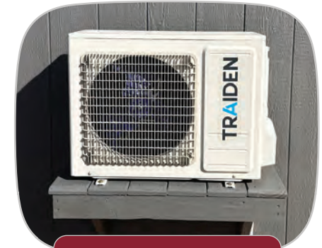
MINI SPLIT EXTERIOR