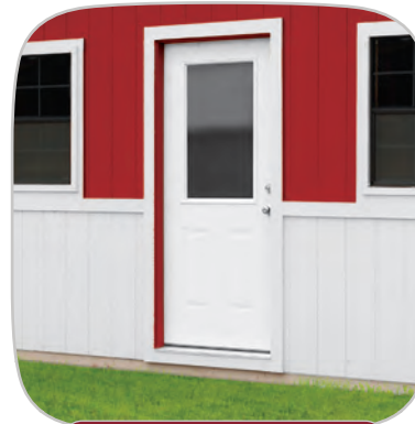
HALF GLASS DOOR