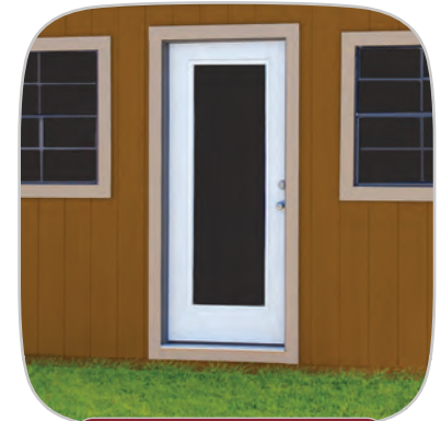
FULL GLASS DOOR