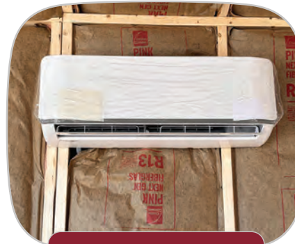
MINI SPLIT INTERIOR