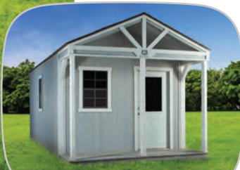
OPEN PORCH OFFICE