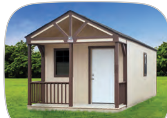
OPEN PORCH OFFICE