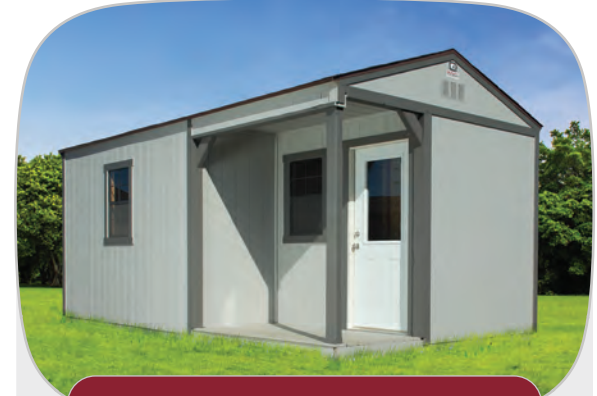
OPEN PORCH OFFICE