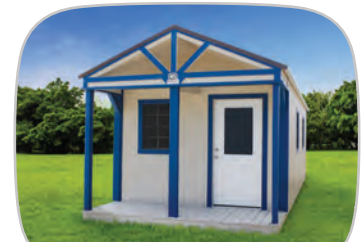
OPEN PORCH OFFICE