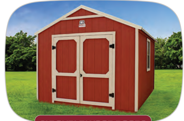
6' DOUBLE WOOD DOORS