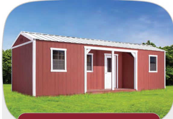
OPEN PORCH OFFICE